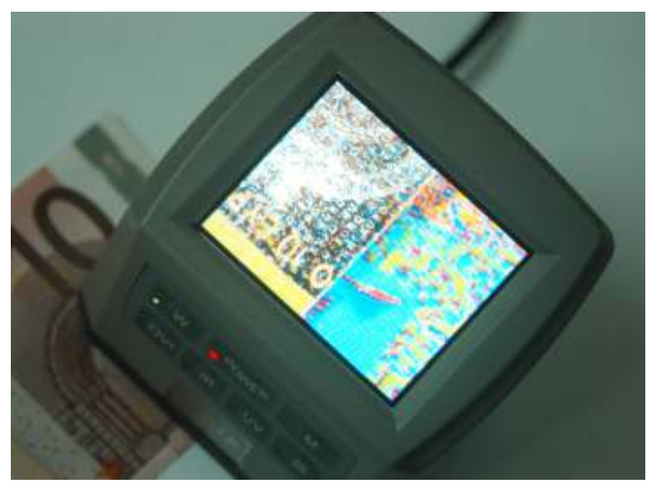
Digital magnifier based authentication