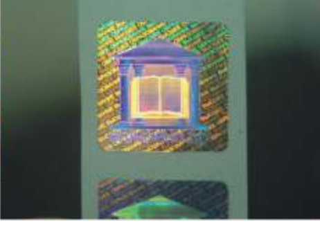
Dot-matrix hologram is a computer generated security hologram with complex security features. It is formed by an array of small dots of holograms.