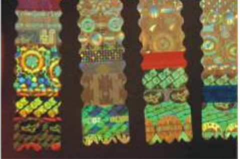
Custom shape holograms can be any kind of security hologram with a specific shape, as preferred by the customer. Special laser dies are applied to include custom shapes so that it adds to the security.