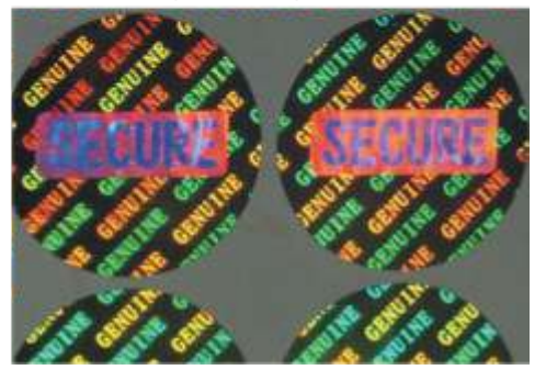
Stock holograms are ready to deliver holograms. No mastering charge is applicable for general stock holograms. Such holograms are generally applied for event entry pass and limited life documents.

It is not just the mastering method or the complexity and the features of mastering that add security. A set of security procedures are to be strictly adhered during the production of security holograms. Light Logics is one of the very few companies that make Combination master security holograms. We follow internationally accepted security norms in the production, right from design to waste material disposal. Our finely crafted security holograms yield perfect patterns when imaged through an AFM (Atomic Force Microscope). AFM is a Nobel prize winning technology that can even image tiny molecules of complex shapes. For your document security and brand protection needs, please contact us. Our engineers are always available for technical discussion and support. E-mail- sales@lightlogics.in, info@lightlogics.in., Phone-+91-471-2383484